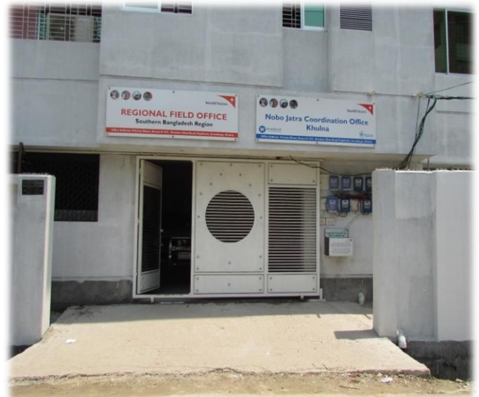
Nobo Jatra Coordination Office, Khulna