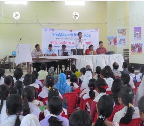
Dacope-UNO speaking on Int'l Women's Day

Dacope Upazila office jointly celebrated the day with the Upazila Administration. A rally was organized and a human chain was formed on the occasion. An open discussion program was arranged in the Upazila Hall Room where representatives from School & College Students, Teachers and NGOs along with the Nobo Jatra Field Office Coordinator, Upazila Vice Chairman and UNO spoke on the day's theme and expressed their hope to see Dacope as an Upazila where gender equitable access to all of our fundamental rights will be prevailed.