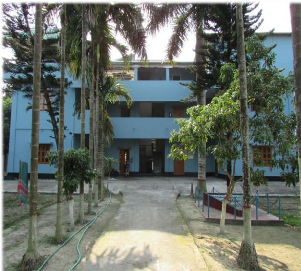
Nobo Jatra Dacope Upazila Office

Nobo Jatra's Divisional office in Khulna was rented in December 2015. It is in the same building that occupies the office of World Vision Southern Bangladesh Region. A number of staff working from this office is 13 till now. The Upazila offices have been rented and four Field Office Coordinators have taken oversight of the programme implementation in the offices.