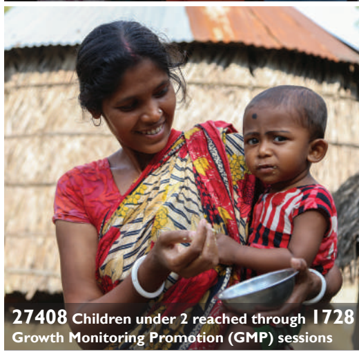
27408 Children under 2 reached through 1728 Growth Monitoring Promotion (GMP) sessions