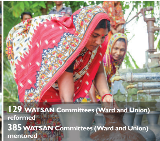
129 WATSAN Committees (Ward and Union) reformed 385 WATSAN Committees (Ward and Union) mentored