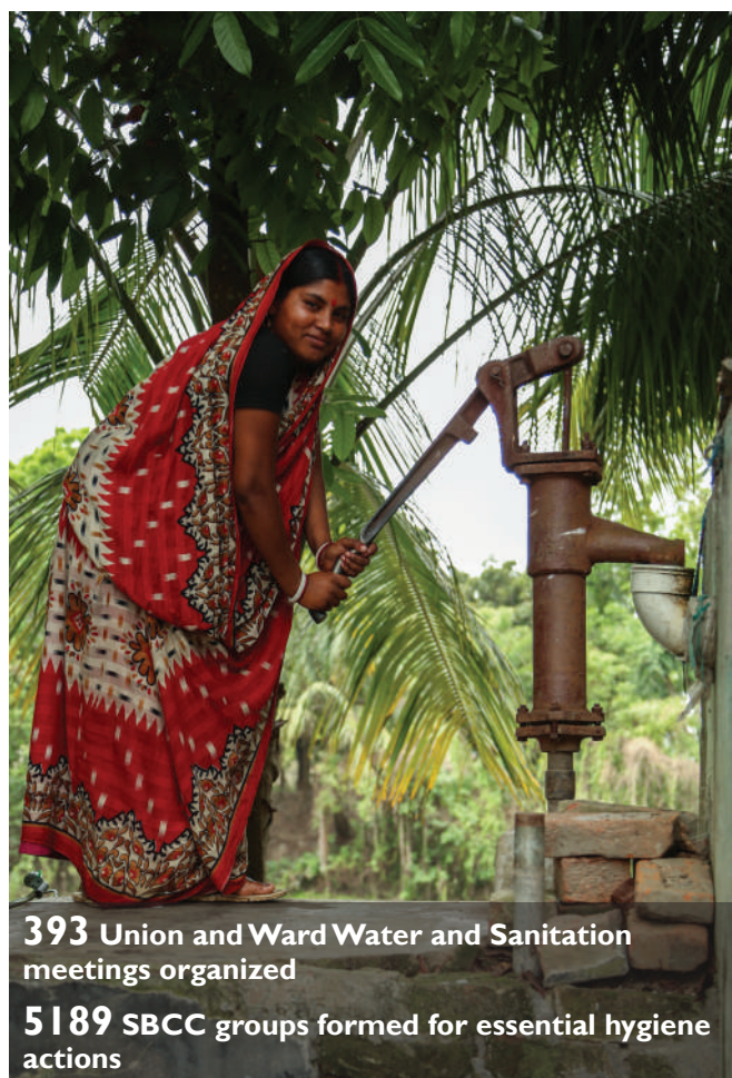
393 Union and Ward Water and Sanitation meetings organized