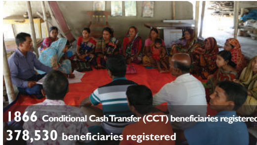
1866 Conditional Cash Transfer (CCT) beneficiaries registered 378,530 beneficiaries registered