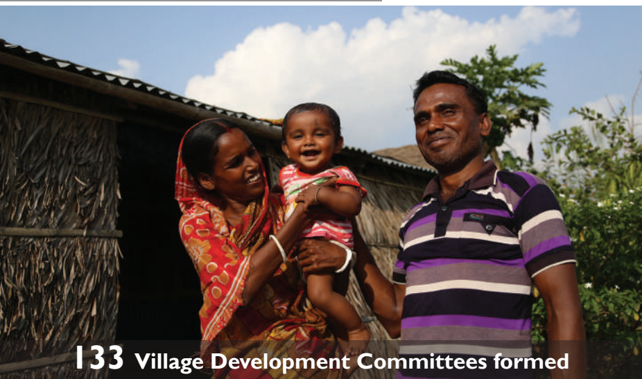
133 Village Development Committees formed