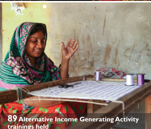
89 Alternative Income Generating Activity trainings held