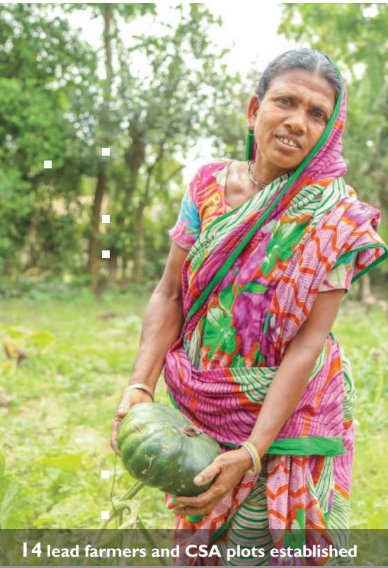
14 lead farmers and CSA plots established