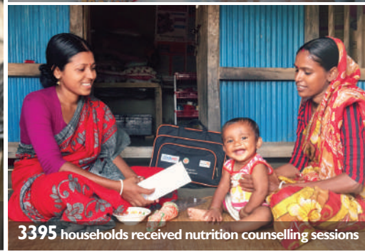
3395 households received nutrition counselling sessions