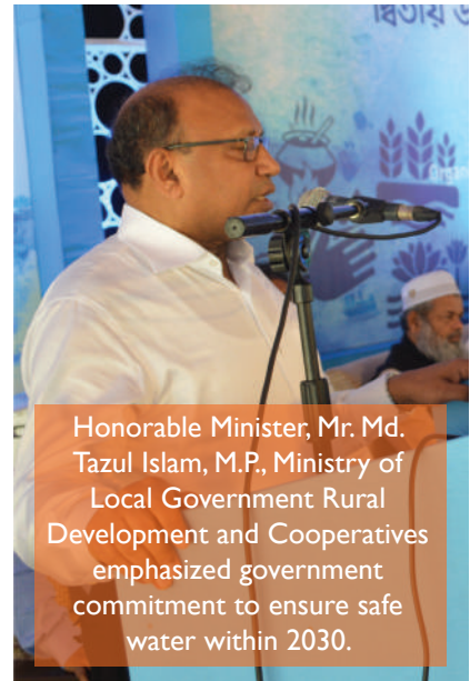
Honorable Minister, Mr. Md. Tazul Islam, M.P., Ministry of Local Government Rural Development and Cooperatives emphasized government commitment to ensure safe water within 2030.

The events brought all stakeholders under a common platform (among public, private and civil society actors) and strengthened collaboration and coordination to overcome challenges to access safe drinking water and affordable sanitation facilities in the coastal districts of southwest Bangladesh. A Khulna declaration was also made on the basis of the findings from the technical sessions under the theme of “Strengthening governance, enhancing private sector engagement, protecting eco-system and adapting to climate change impact”.